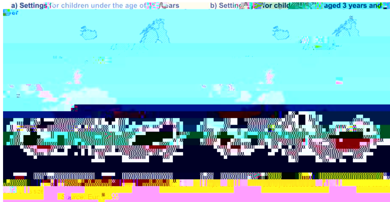
Figure A7: Significance of private self-financing centre-based ECEC provision, 2018/19